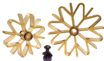
6" & 8" POLYSULFONE ATDS & BLANK END PLUG

Synder Filtration stocks large inventories of the accessories and spare parts required for membrane installation and operation. With a wide range of Anti-Telescoping Devices (ATDs) and Lip Seals to fit all of our sanitary membranes, Synder can supply or replace these accessories with exceptional speed to help prevent delays in production or pilot testing. We can also provide full sanitary grade housings for our elements, which can be customized to fit any system. Contact us to find the most appropriate ATD, Lip Seal, or housings for your membrane and feed solution.