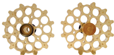
3.8" POLYSULFONE ATD INTERCONNECTOR & END PLUG