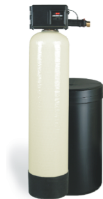
WATER SOFTENER & CARBON FILTER