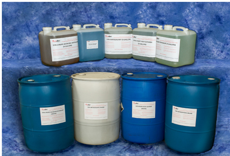
Membrane Cleaner Products

Synder offers a set of concentrated membrane cleaner products, available in liquid and powder form. The typical use concentration is a 1% solution, providing a cost effective dilution when compared to other products. The non-oxidizing biocide, Excide™ 20, is an EPA registered antimicrobial for use on membrane systems.